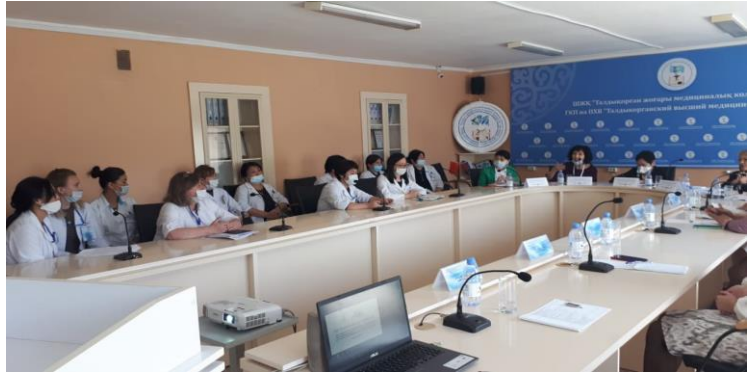
Photo 3. EEC conducts an interview with the chairperson of the CEP and the heads of the offices.

Regulatory documents, satisfaction with book supply and material and technical equipment of the EP, meaningful content of the EP, the presence of clinical bases, the use of traditional and innovative methods and forms of education, the presence of a system for assessing the activity of the CEP and the teacher, satisfaction with working conditions and forms of stimulating pedagogical activity.